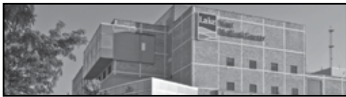
Lake Health West Medical Center – Willoughby, OH 20 minutes east of Cleveland, OH

Systems Medical Director to oversee both Lake Health West and Lake Health TriPoint Medical Centers Full-time and part-time staff physicians and mid-level practitioners Criteria: BC/BE EM