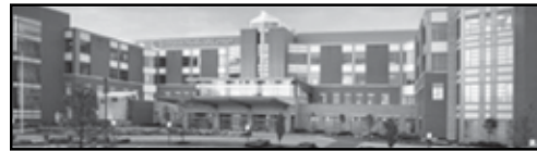
Lake Health TriPoint Medical Center – Concord, OH 30 minutes east of Cleveland and 5 miles south of Lake Erie